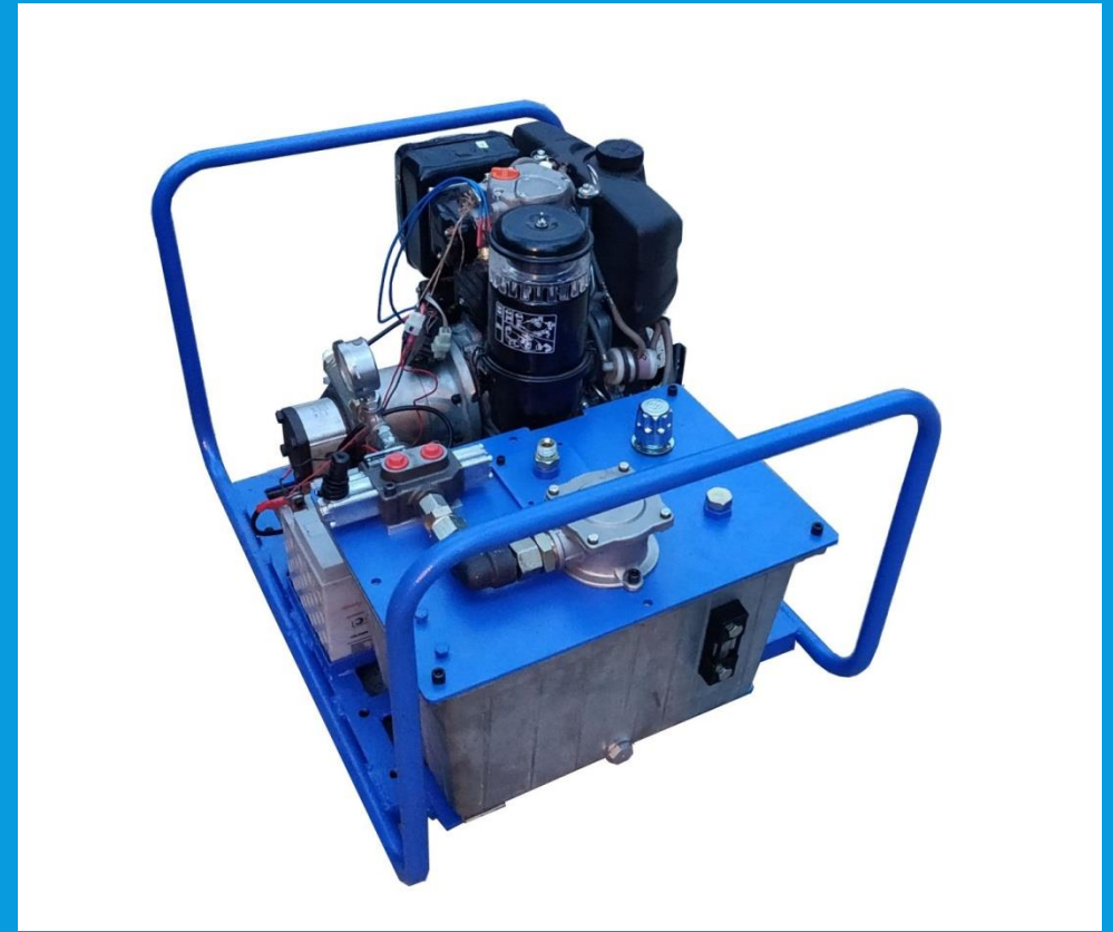
GOWIN POWERPACK DIESEL DRIVEN WITH LOMBARDINI KOHLER LD440 ENGINE