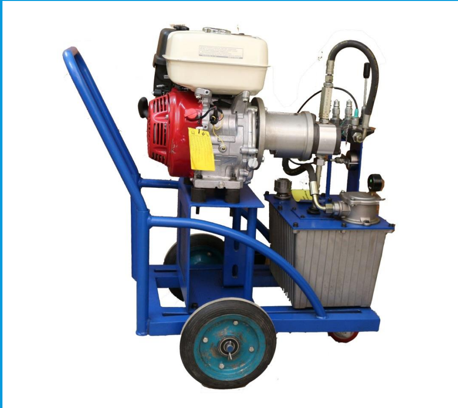
GOWIN POWERPACK PETROL DRIVEN WITH HONDA GX270 ENGINE