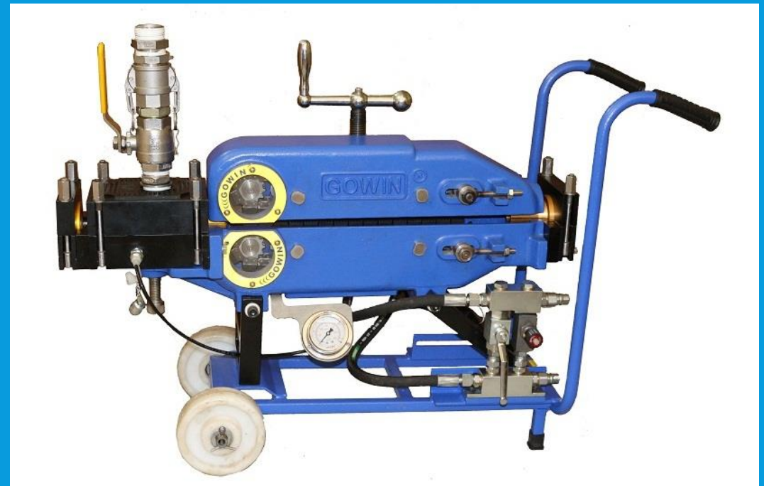
GOWIN 1025 WHEEL MOUNTED